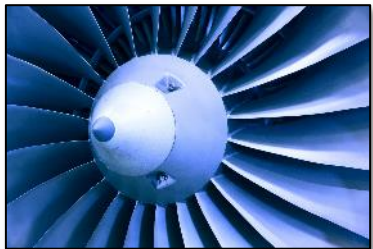
Engine and Asset Optimization