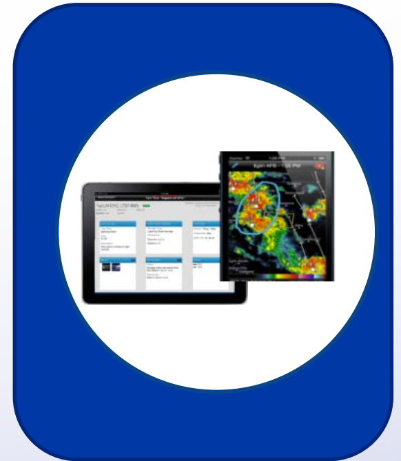
Applications and Delivery