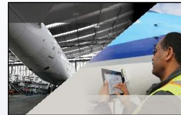
Optimized Maintenance Program