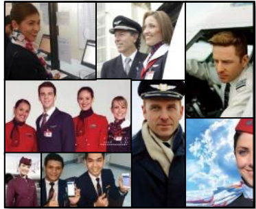
Crew and Fleet Optimization