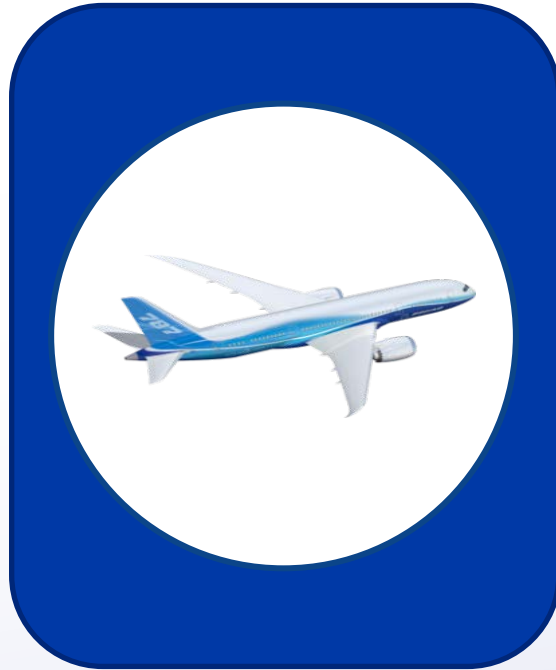
Aerospace Domain Knowledge