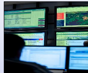
Airplane Health Management