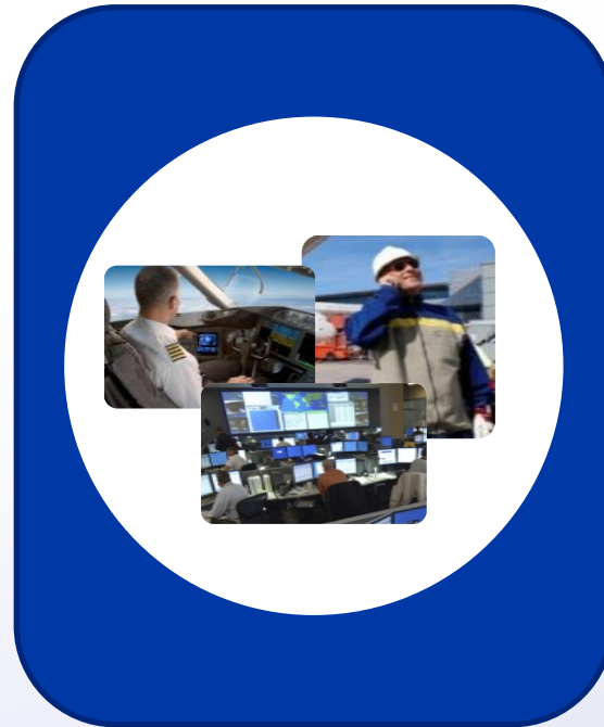
People and Processes